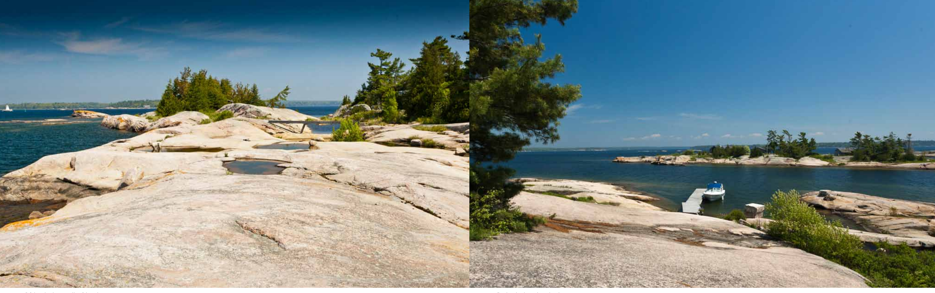
Bridge between the islands

A simple bridge linking the two islands leads to the only remaining original structure, the sleeping cabin.