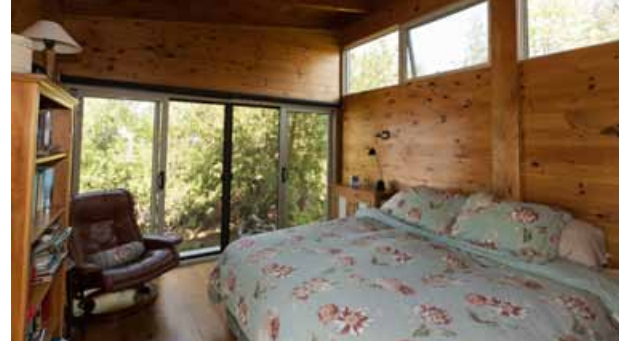
Master bedroom has three piece ensuite and walk outs onto wooden deck.

The dining room with propane fireplace and walkouts to deck.