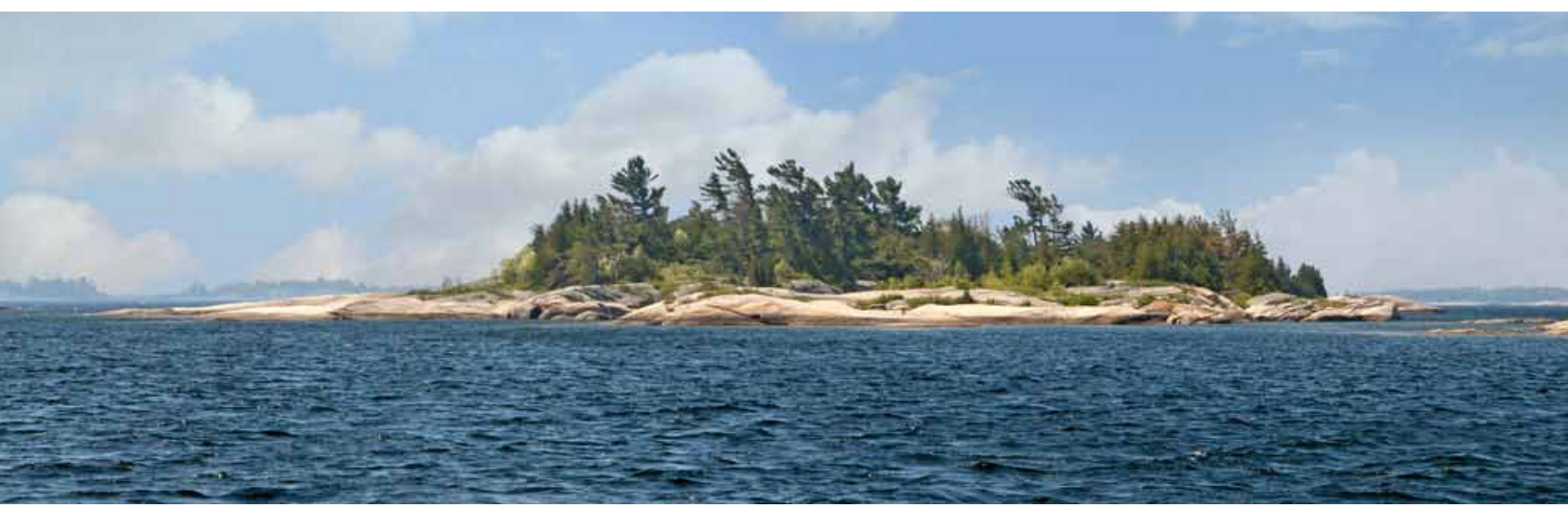
View from North