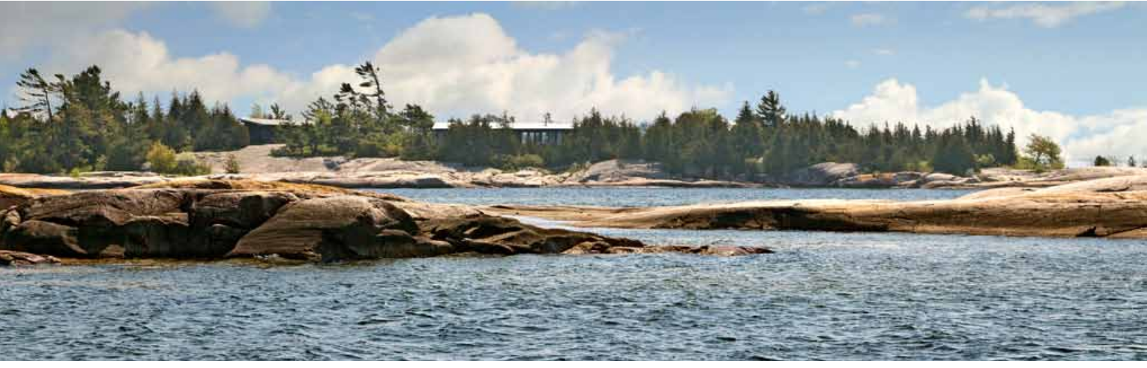
View from West