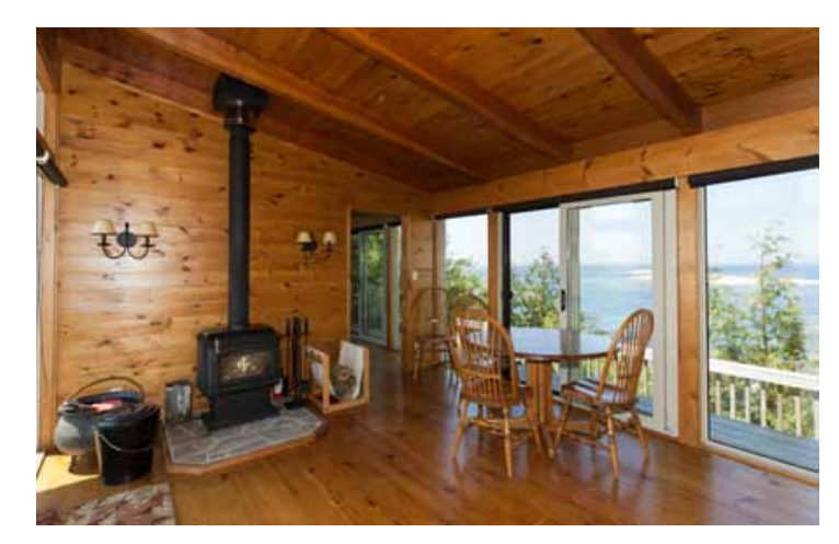
Open plan sitting room and kitchen.

The Guest Cottage is sited on elevated ground with western views of 'whale backs' and open water. The cottage is entirely self-sufficient and features a kitchen/sitting room with wood burning stove, three bedrooms and a three piece bath. Decking surrounds three sides of the structure.