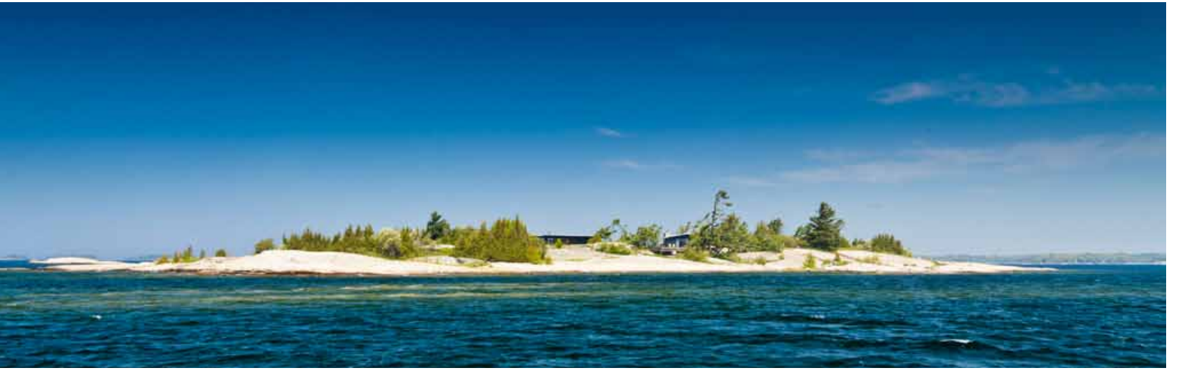
View from South East