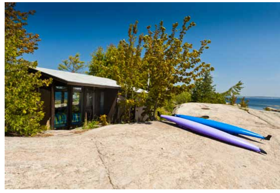
Tucked into a grove of trees the original 400 sq.ft. sleeping cabin dating from the 1960's has recently been refurbished.

A simple bridge linking the two islands leads to the only remaining original structure, the sleeping cabin.