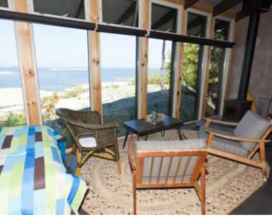
Western views at water level

Perfect for adolescents or overflow guests the cabin sleeps five, has a Vermont wood burning stove and composting toilet. Floor to ceiling glass doors open onto stunning water level views to the west.