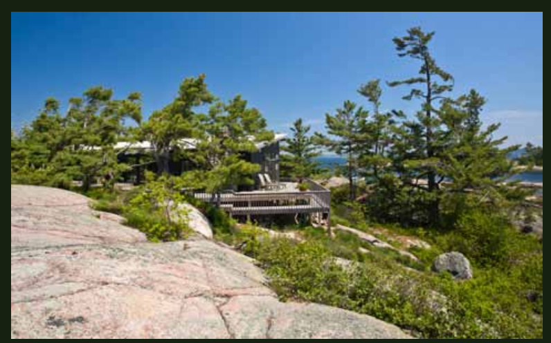
Sentinel white pine estimated to be over five hundred years old.

Ancillary structures; pump house, tool shed, generator hut and solar hut are well removed from living quarters and discretely hidden amongst the trees and undergrowth.