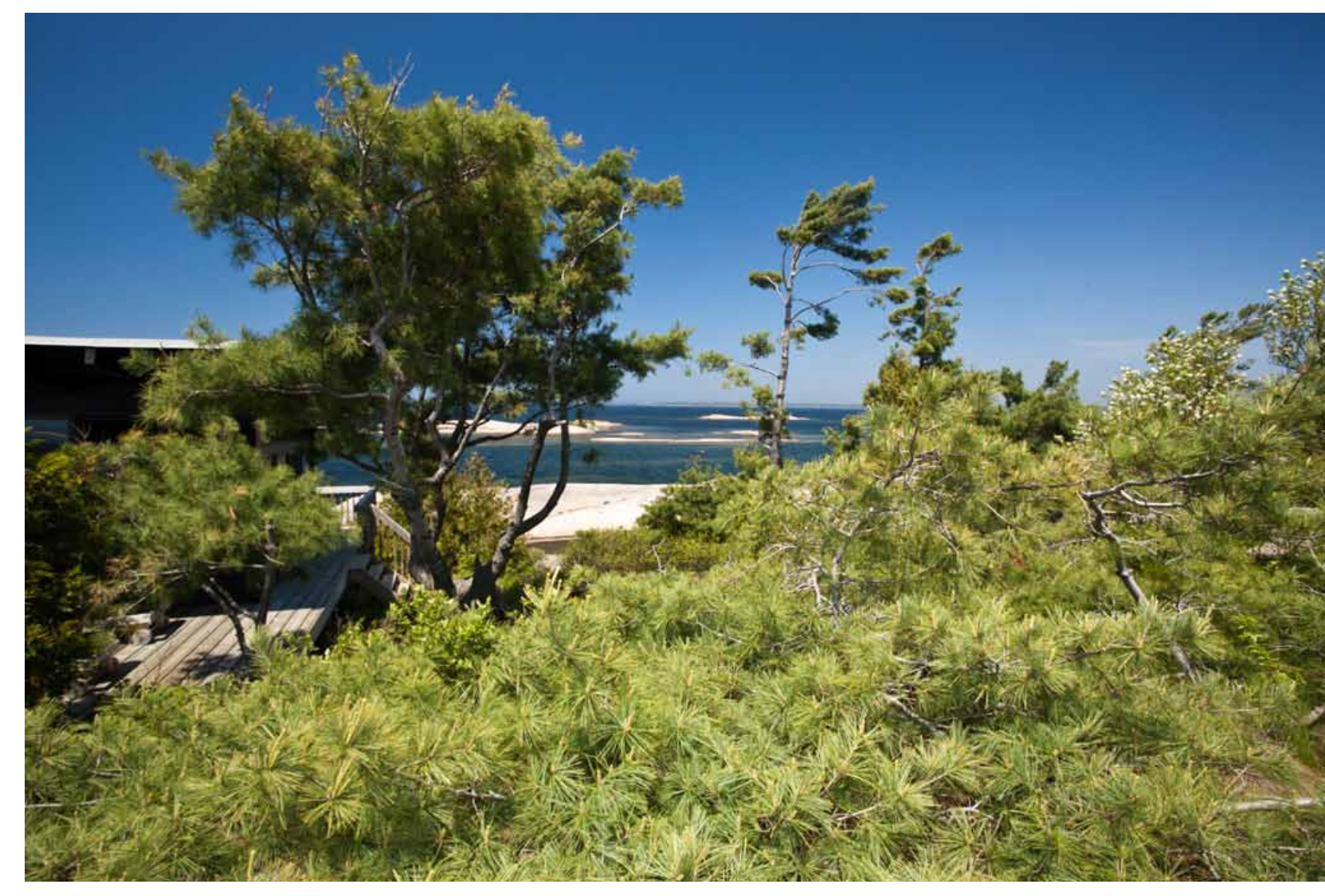
View from Guest Cottage

The Guest Cottage is sited on elevated ground with western views of 'whale backs' and open water. The cottage is entirely self-sufficient and features a kitchen/sitting room with wood burning stove, three bedrooms and a three piece bath. Decking surrounds three sides of the structure.