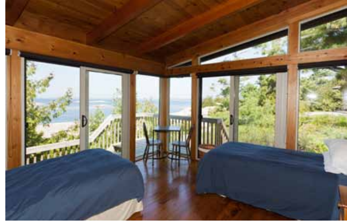
One of three bedrooms in the guest cottage.