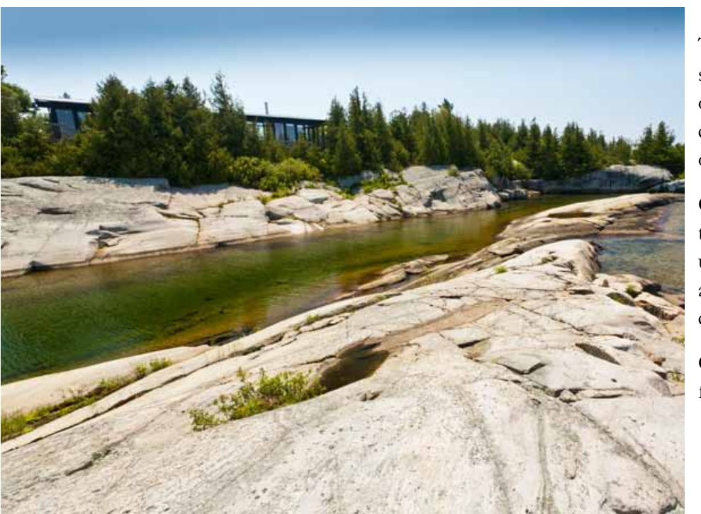
Guest Cottage viewed from the smaller island

The cottages feature simple steelsheathed shed roofs with protective overhangs and exterior cedar cladding designed to protect against the vagaries of Georgian Bay weather.