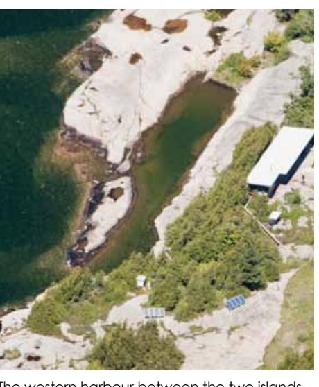
The western harbour between the two islands